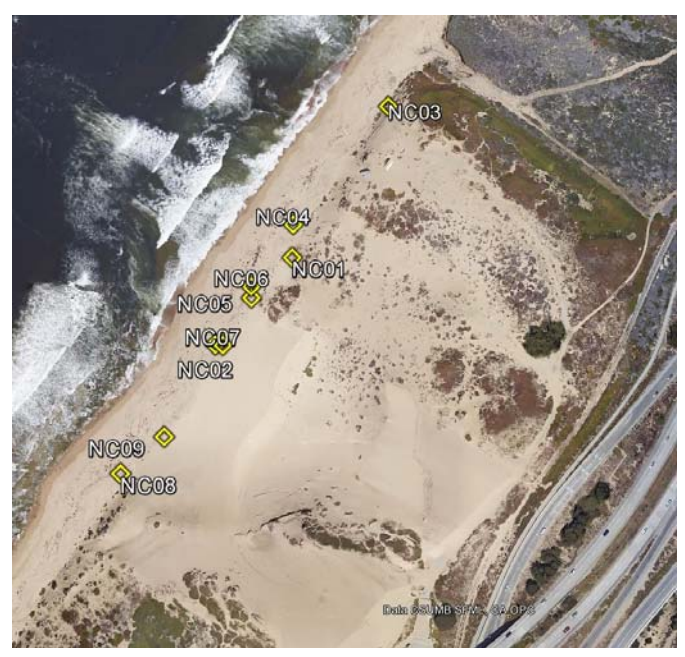
Figure 3 . Western snowy plover nest locations on the Project site during 2015. Nest NC08 consisted of a hatched broad of three chicks.